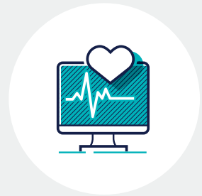
PROMOTES CARDIAC HEALTH