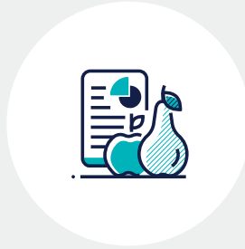
IMPROVES WEIGHT CONTROL