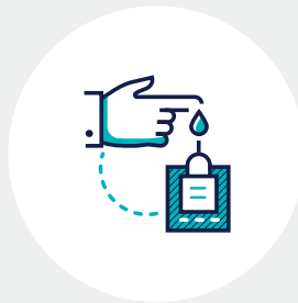
REGULATES BLOOD SUGAR