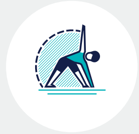
LESS MUSCLE TENSION